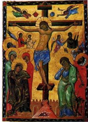
SEASON OF LENT

Welcome to any visitors with us this morning! Please join us after worship for a time of fellowship over a cup of coffee.